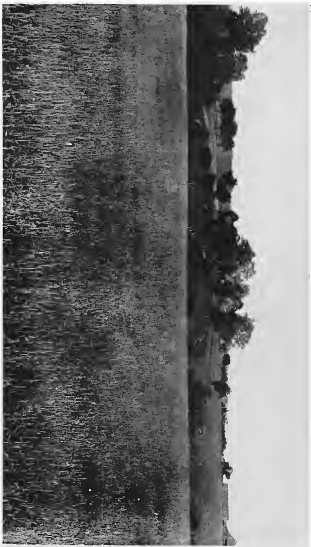
• LEE'S HEADQUARTERS—THE WILDERNESS